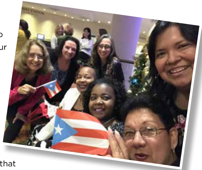
BCAC representatives with Puerto Rican advocates at SABCS 2017