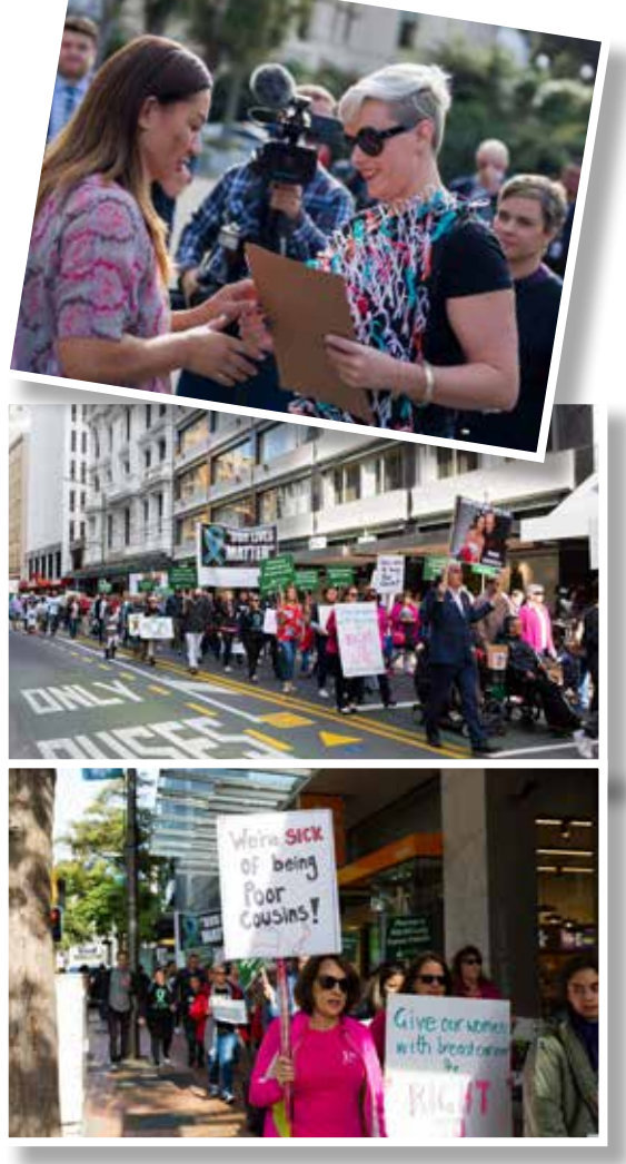
The images are from the march to Parliament for 6 health groups and 2 individuals to present 8 petitions in total.