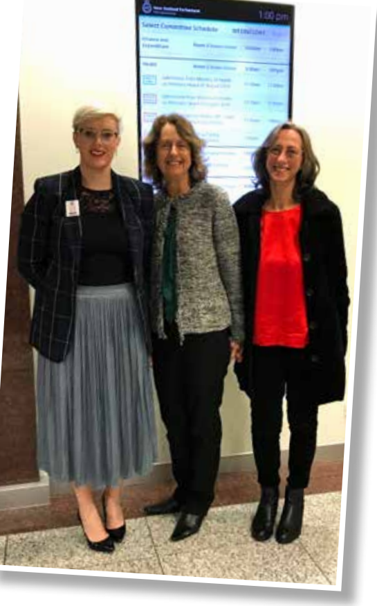
BCAC members the day of Kadcyla funding announcement